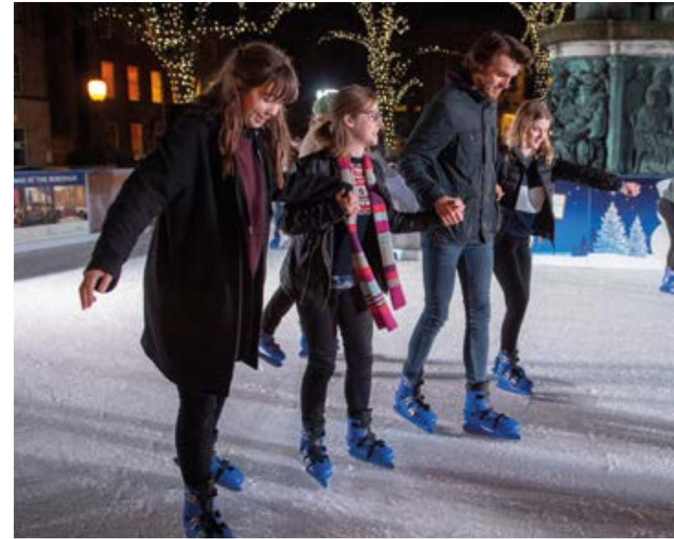
– History students enjoying the winter ice skating rink in Dalton Square, Lancaster.