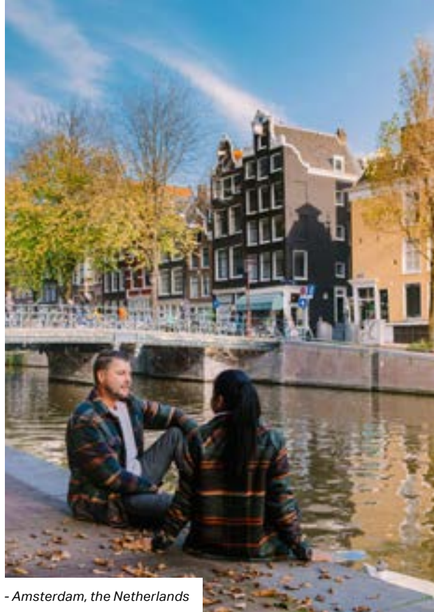
- Amsterdam, the Netherlands

You'll be able to access horizon-expanding opportunities around the world, with exciting possibilities ranging from short vacation travel to longer study abroad options.