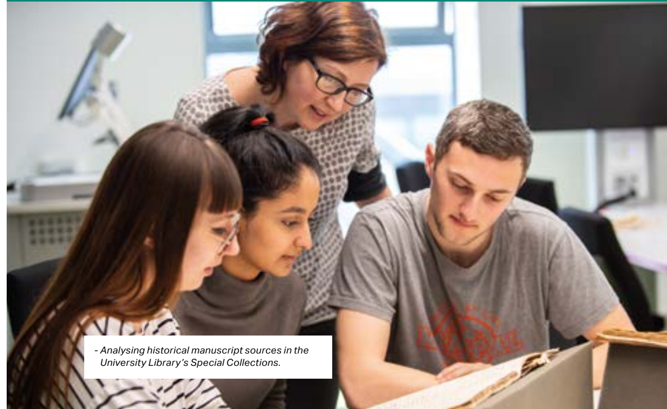
- Analysing historical manuscript sources in the University Library's Special Collections.